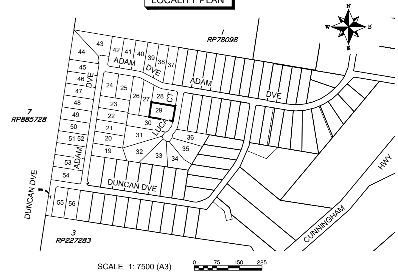
SCALE 1: 7500 (A3)